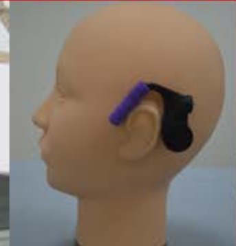
The warning Device of Anti Doze