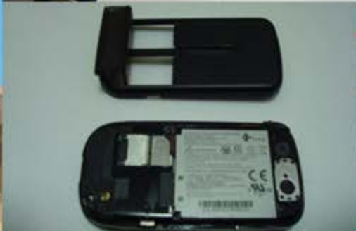
Antenna with Reconfigurable Radiation Patterns