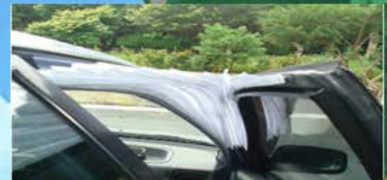
Automobile Water-resistant and Sunscreen Device